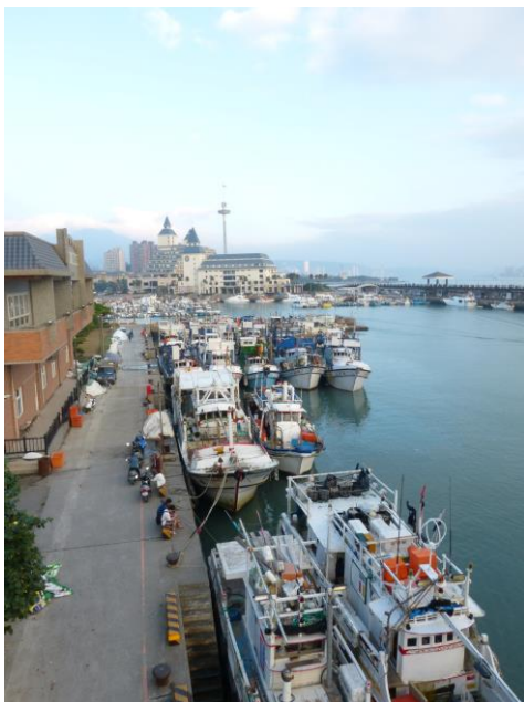
Fishing boats at Tamsui

Selected highlights reported by John Holdsworth and Keller Kopf for the New Zealand Sport Fishing Council, November 2013. For a full list of the Symposium topics go to: http://billfish5.oc.ntu.edu.tw/program.html