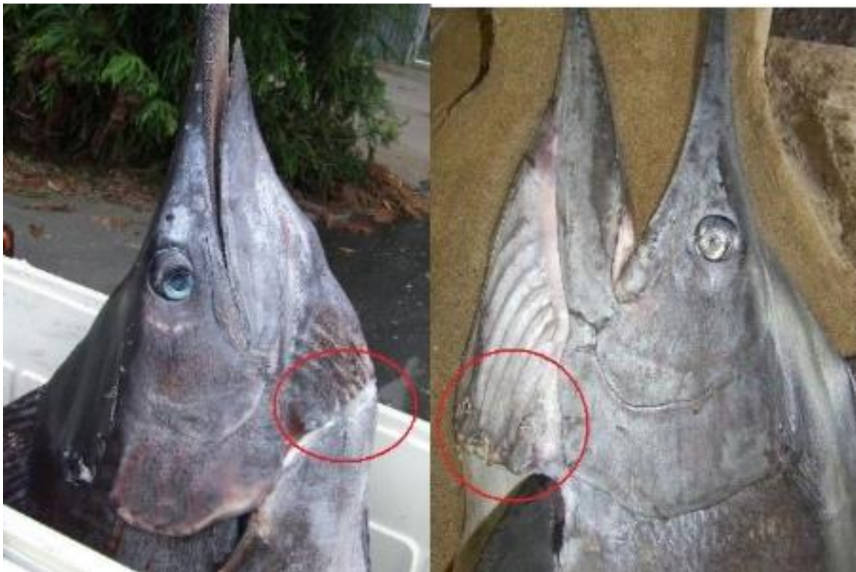
Figure 1: The shorter frill covering the gills in blue marlin (left) than black marlin (right) is diagnostic.

The New Zealand marlin ID project found several measurements that were useful for separating the three marlin species across the whole size range, however no single characteristic separated all three. The branchiostegal membrane or frill covering the gills is shorter in blue marlin (16% to 19% of body length) than in black and striped marlin (Figure 1). Black marlin have a shorter dorsal fin than striped marlin. While size, body shape and pectoral fins are still useful, a few quick measurements can confirm species where there is doubt. These species IDs were backed up by genetic analysis.