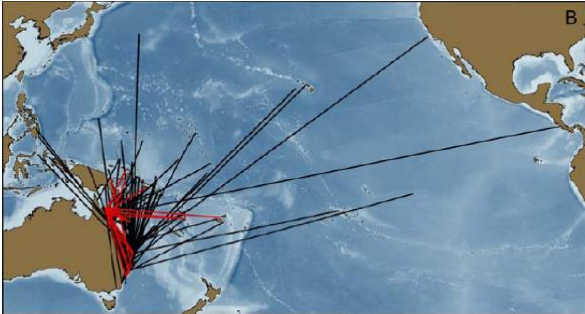
Figure 4: Recapture locations for black marlin tagged in Australia, mature fish (red) (Domeier & Speare 2012).

but is that the only one in the Pacific? Where do black marlin from the Indian Ocean come from? Over 56,000 black marlin have been tagged in Australia and 390 recaptures reported (Figure 4). Much of what we know about the movement of this species comes from fish tagged by sport fishers. The combined information from tag cards also provides a detailed record of recreational catch and trends in the fishery. And most of the fish survive. Win Win Win.