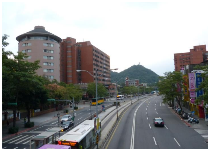
The hotel and conference venue Taipei